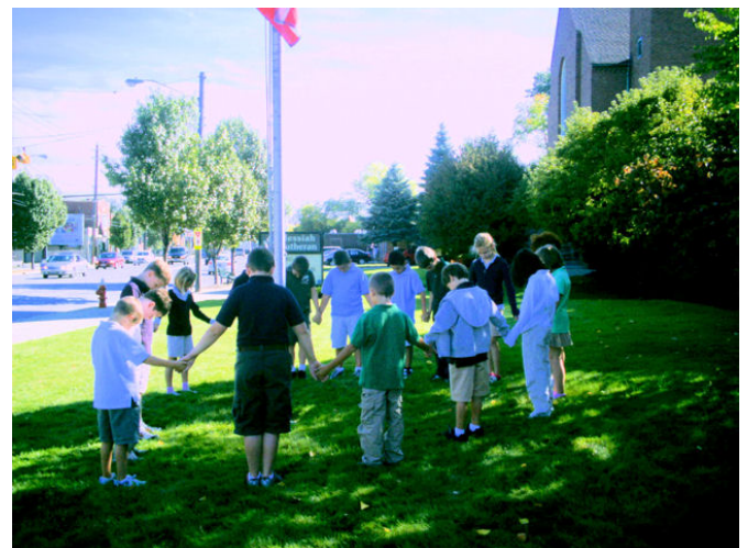
Messiah 3rd Graders sharing a moment of silence on September 11th. They prayed for the country and for Christians to be bold in their witness.

Remember Messiah Lutheran School, Lakewood Lutheran School, the children and the staff members in your prayers. Pray with us that God will work in each of us to produce much fruit for His Kingdom.